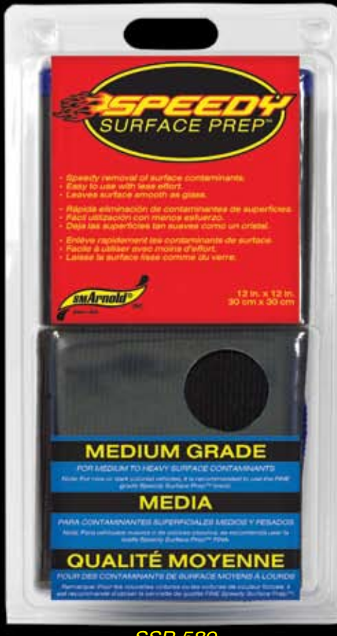
SSP-589 FOR MEDIUM TO HEAVY SURFACE CONTAMINANTS