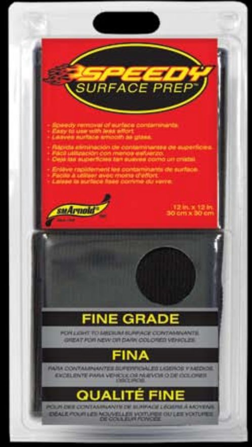
SSP-580 O MEDIUM SURFACE CONTAMINAN NEW OR DARK COLORED VEHICLE FOR LIGHT TO MEDI AT FOR